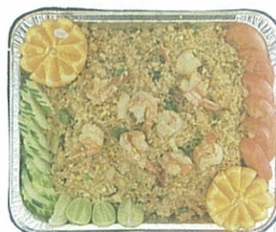
THAI FRIED RICE